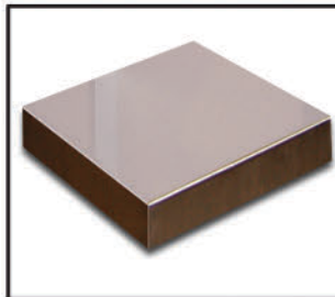
Stainless steel cover for harsh environments and corrosive materials.