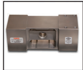
Hermetically sealed stainless steel load cell.