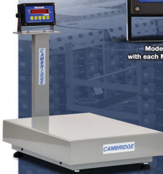
Model 640-B20 with CSW-10AT indicator

Model CSW-10AT indicator included with each Model 640-B for a perfectly matched check weighing system.