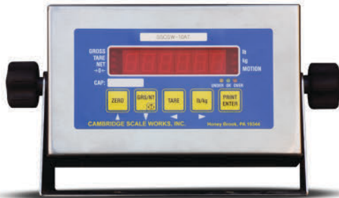
SS10AT front view