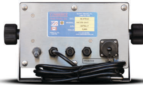
SS10AT rear view