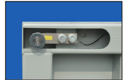
Self checking captive ball leveling feet.