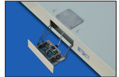
Easy access to side mounted polycarbonate NEMA 4x junction box.